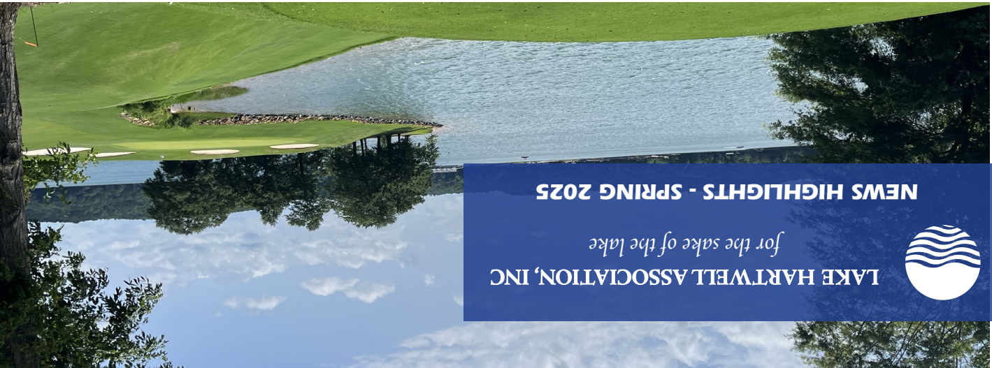
May 2024

NONPROFIT ORG US POSTAGE PAID Anderson, SC Permit #157